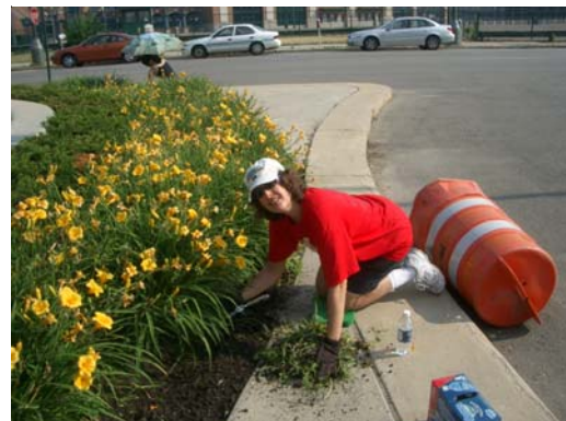
Even our illustrious president got her hands and knees dirty.