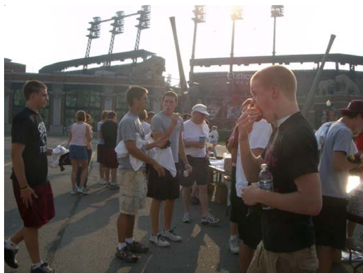
The football team of Seaholm High School in Birmingham would use every carb.