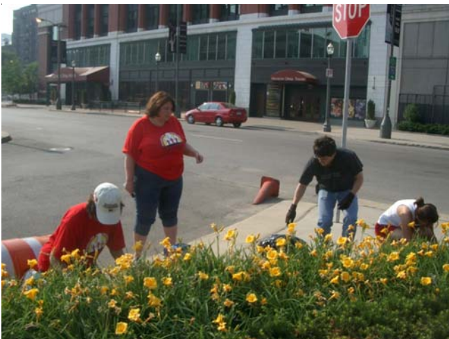
Mitch Albom digs in to clean up Detroit before the All Star game.