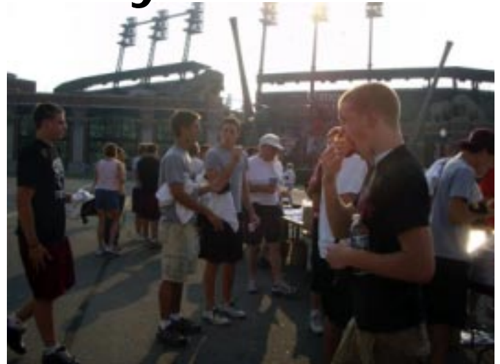
Volunteers from Seaholm High School in Birmingham took time for a healthy breakfast at Comerica Park before getting to work last year.

Call Volunteer Impact at (248) 932-2580 and tell us you want to help. We'll plug you into the process. You get great music, free