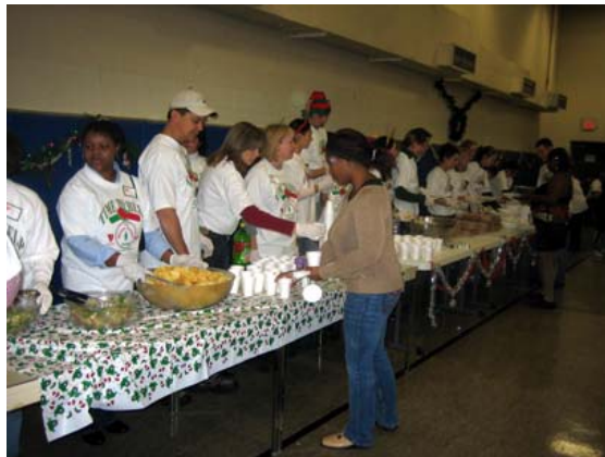
Volunteers at the Booth Evangeline Salvation Army Shelter serve their guests.