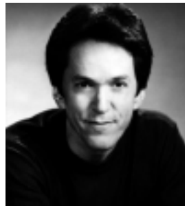
Free Press Columnist and Volunteer Impact MVP Mitch Albom

While the Super Bowl Community was partying into the night, rubbing shoulders with CEOs and celebrity's alike, VI's own celebrity member Mitch Albom recently spent a night sleeping at the Detroit Rescue Mission. And although the Super Bowl Committee planned special events for the homeless for the three days leading up