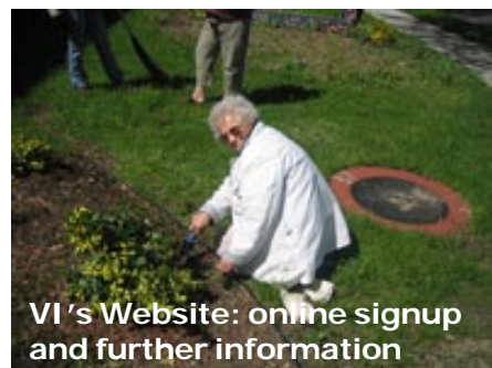
VI's Website: online signup and further information