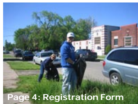
Page 4: Registration Form