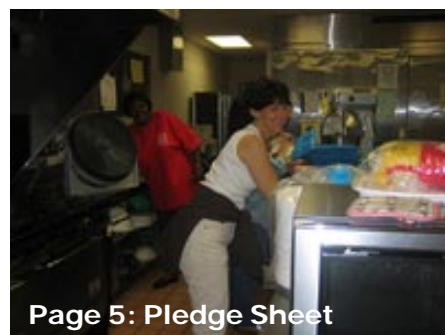
Page 5: Pledge Sheet