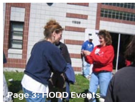
Page 3: HODD Events

Registration and Pledge forms, found on Pages 4-5 within, can also be downloaded from the FORMS tab on the top of our website. Or, if you prefer the documents in Word format, just e-mail us at volunteer_impact@yahoo.com and we will e-mail you the forms.